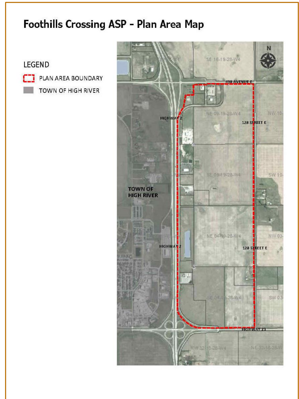
Figure 1. Plan Area Map

The Foothills Crossing (ASP) will guide future development of a commercial area on the east side of Highway 2 between the Highway 23 and 498th Avenue interchanges, near the Town of High River. The Plan Area is shown in Figure 1. Below.